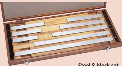
Steel 8-block set