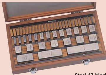
Steel 47-block set