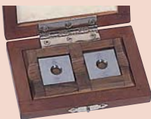
Carbide 2-block set